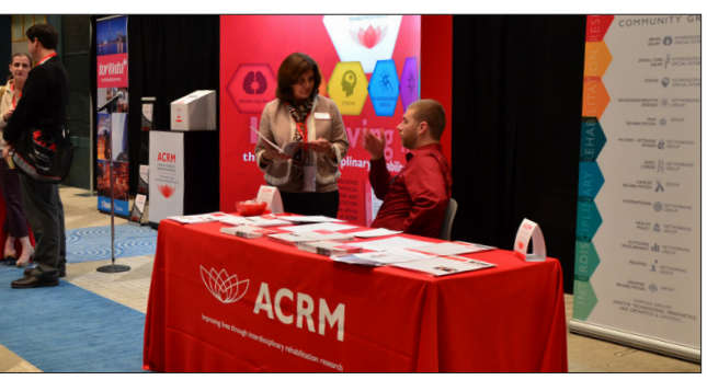
EXHIBIT SPACE IS LIMITED to a select number (only 150 spaces) to provide ample opportunity for quality one-on-one interactions

The most-cited scientific journal in rehabilitation medicine